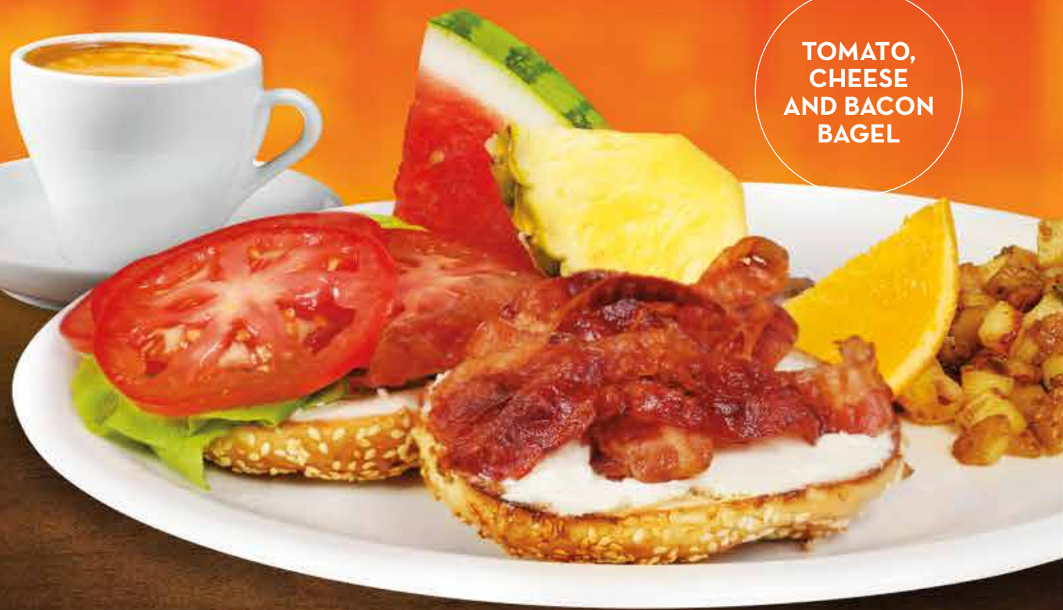
TOMATO, CHEESE AND BACON BAGEL